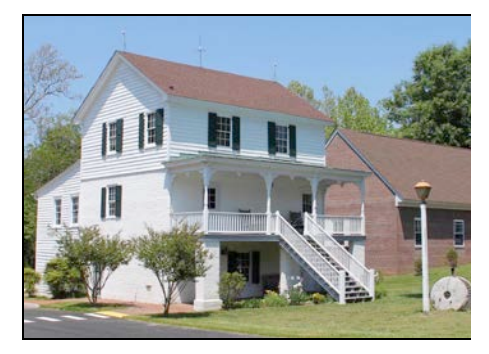
Courthouse Tavern Museum