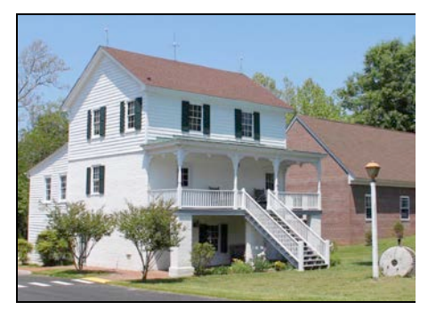
Courthouse Tavern Museum